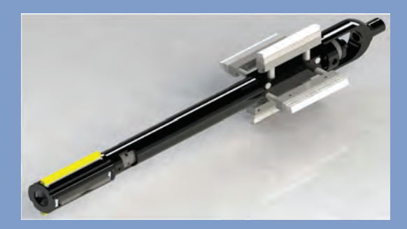
"Junior" + "Standard" Head Honing Tool (for dis-similar bore sizes)